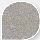
Bright Silver 16, 25mm