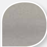
Sterling 16, 25, 50mm