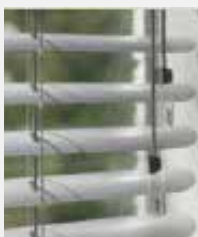
Standard Aluminium Venetian