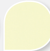
Euro Rich Cream 16, 25, 50mm