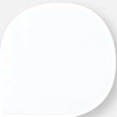
Clean Brilliant White 25, 50mm