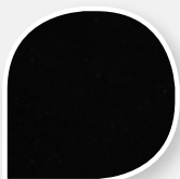
Ebony 16, 25, 50mm