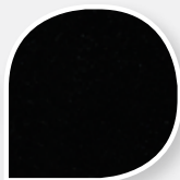
Black 16, 25mm