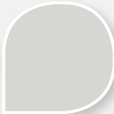
Grey Gloss 50mm