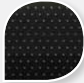
Ebony 8% Perforated 25, 50mm