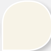
Warm Pure Silk 16, 25, 50mm