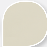
Classic Porcelain 25mm