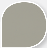
Traditional Donkey 25mm