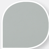
Smooth Grey Sheen 16, 25mm