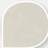
Fresh Alabaster 16, 25mm