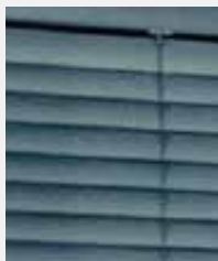
TWI-NIGHTER® Venetian Blinds